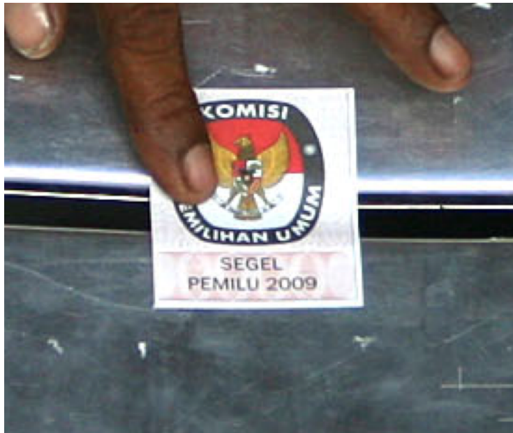
(Australian Government Department of Foreign Affairs and Trade)