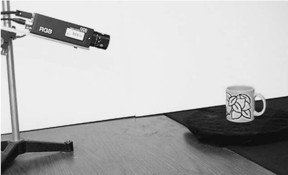
Figure 2: The objects were placed at the center of a motorized turntable. The turntable was rotated through 360 degrees. An image was acquired with a fixed camera at every 5 degrees of rotation.