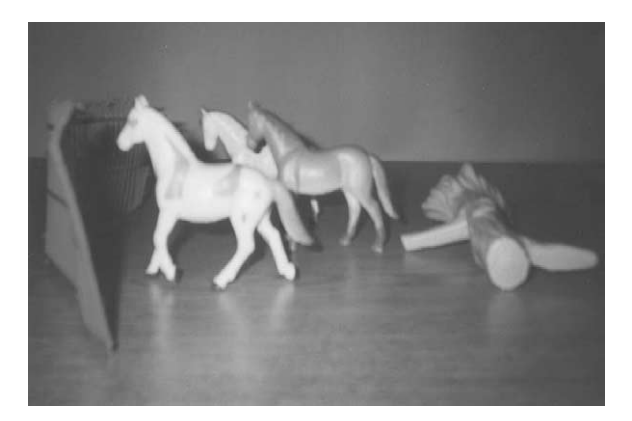
Fig. 1. The horses are about to jump over the fence.

So, for example, in the story corresponding to (9), three horses tried to jump over a fence (Fig. 1) and all three of them managed to do so (Fig. 2). Describing this situation by using a sentence like (9) is therefore pragmatically infelicitous, albeit truth-conditionally accurate, because the use of merika ('some') in (9) implies that not all of the horses jumped over the