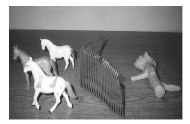
Fig. 2. All of the horses jumped over the fence.

fence. To the extent that subjects are sensitive to this implicature, they should judge (9) to be a 'bad' description of a situation in which all of the horses jumped over the fence.<sup>4</sup>