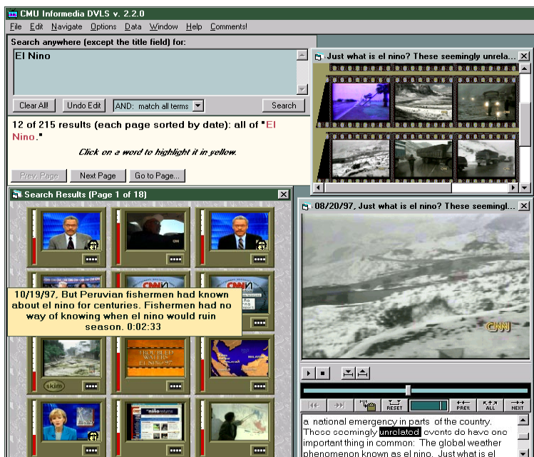
Figure 1: Informedia interface following “El Niño” text query and display of one text title, one filmstrip and one video

Figure 2 presents a schema for the system. Through the extraction of appropriate metadata from diverse video collections, relevant information can be synthesized and presented driven by the user’s needs. Currently users may visit numerous video collections in search of an answer that reveals itself only in bits at a time, such as an unfolding story of a famous criminal trial or a regional political conflict. Video information collages will emphasize dimensions of importance to the user so that the full context can be understood and navigated to narrow the focus to a particular information thread, resulting in only the most useful video pieces then being played.