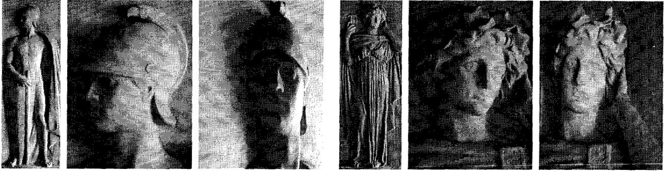
Figure 1: The figure shows two frontal views and a side view of a pair of bas-relief sculptures. Notice how the frontal views appear to have full 3-D depth, while the side view reveals the extent of the flattening.