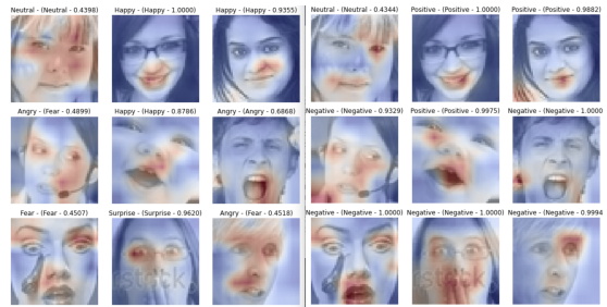
Figure 1: Contrast in attention heat maps across 9 random images: a CNN model trained on a 7-category dataset (left) vs. the same dataset categorized into 3 groups (right). Regions of high attention are shown in red.