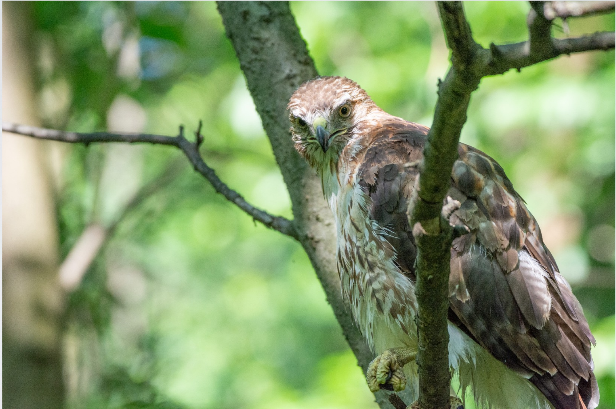
Central Park, New York City, July 2019