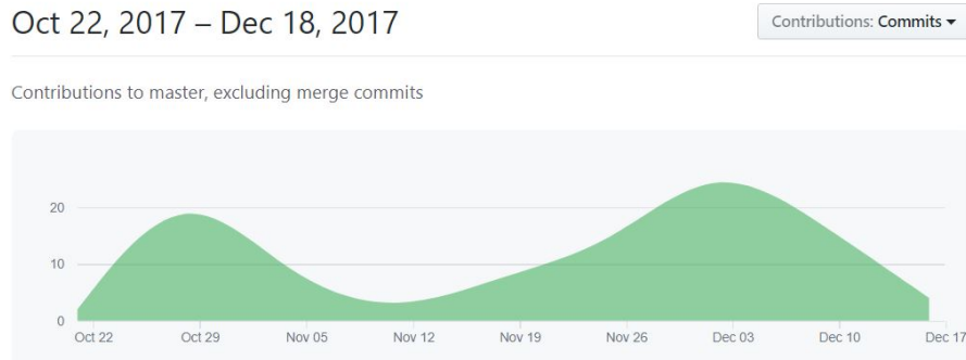
Figure 1: Log of Git commit history from Github

Figure 1 details the overall commit history from the start of our coding. We got started shortly after the LRM milestone on October 16, and worked diligently at the start. The log provides the evidence for our earlier statements that we fell off track for a bit shortly after the hello world program. The generation of our own milestones, as detailed in section 4.3, helped us to overcome this block, which resulted in a large push towards the end. Had we determined some of those earlier, our commit distribution may have been slightly more even.